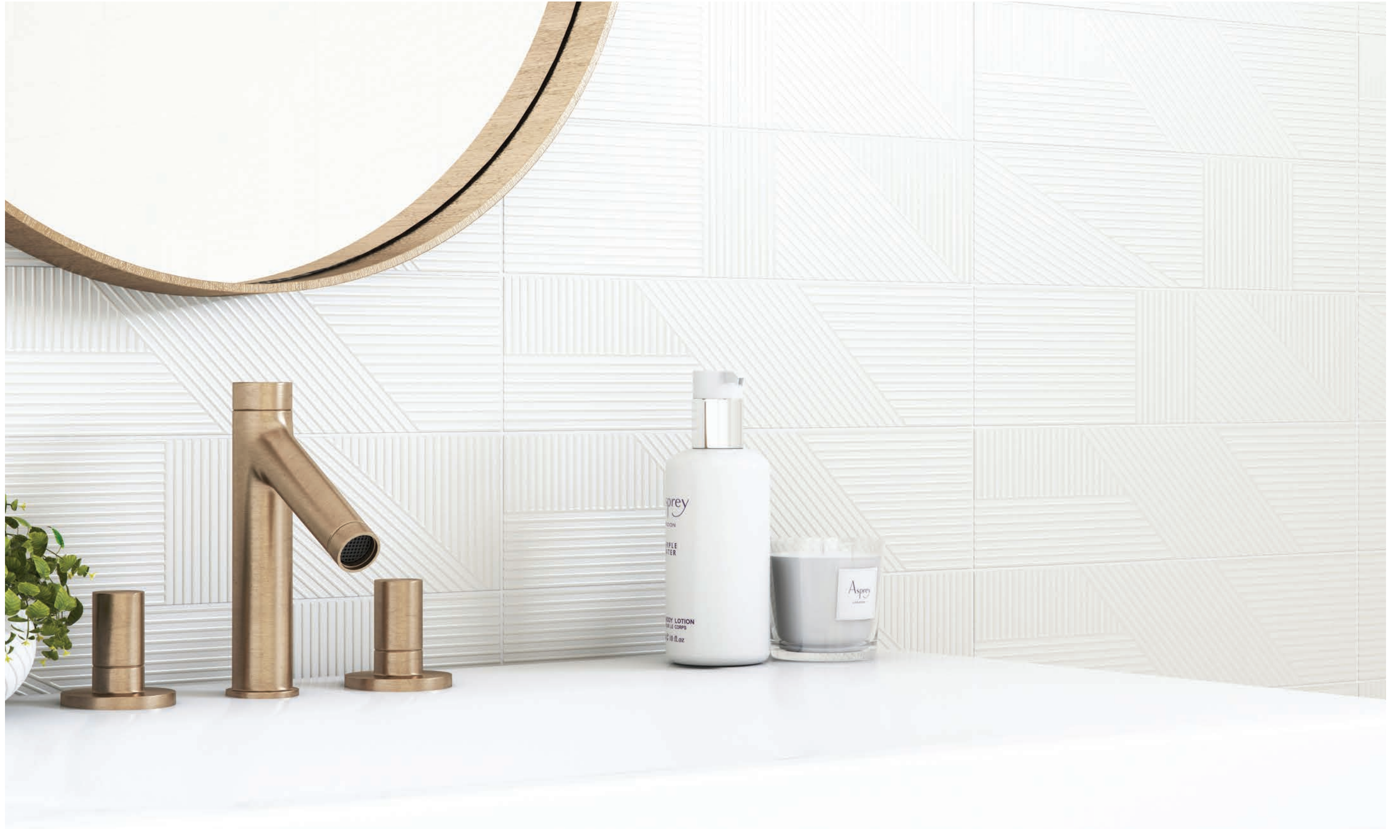
4"x16" Opera Wall Deco in Blanco