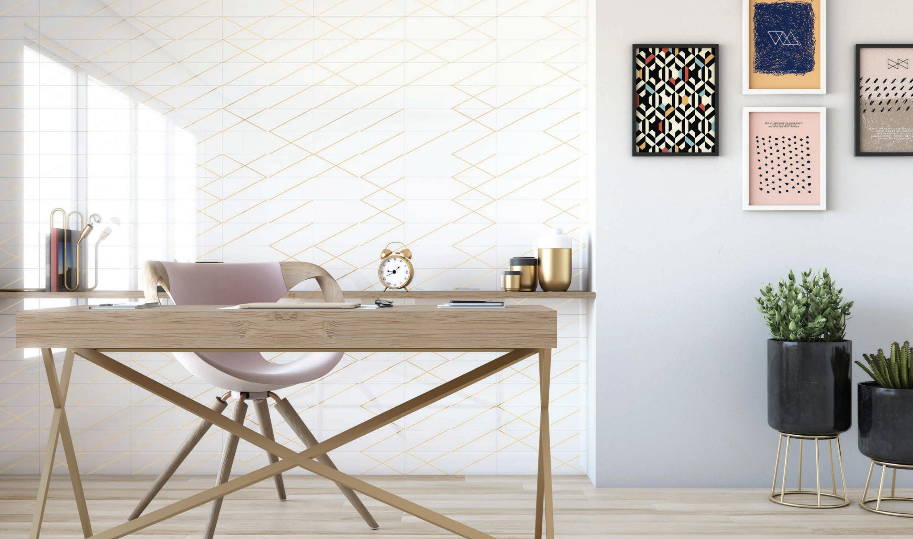
4"x16" Tribal Wall Deco in Blanco