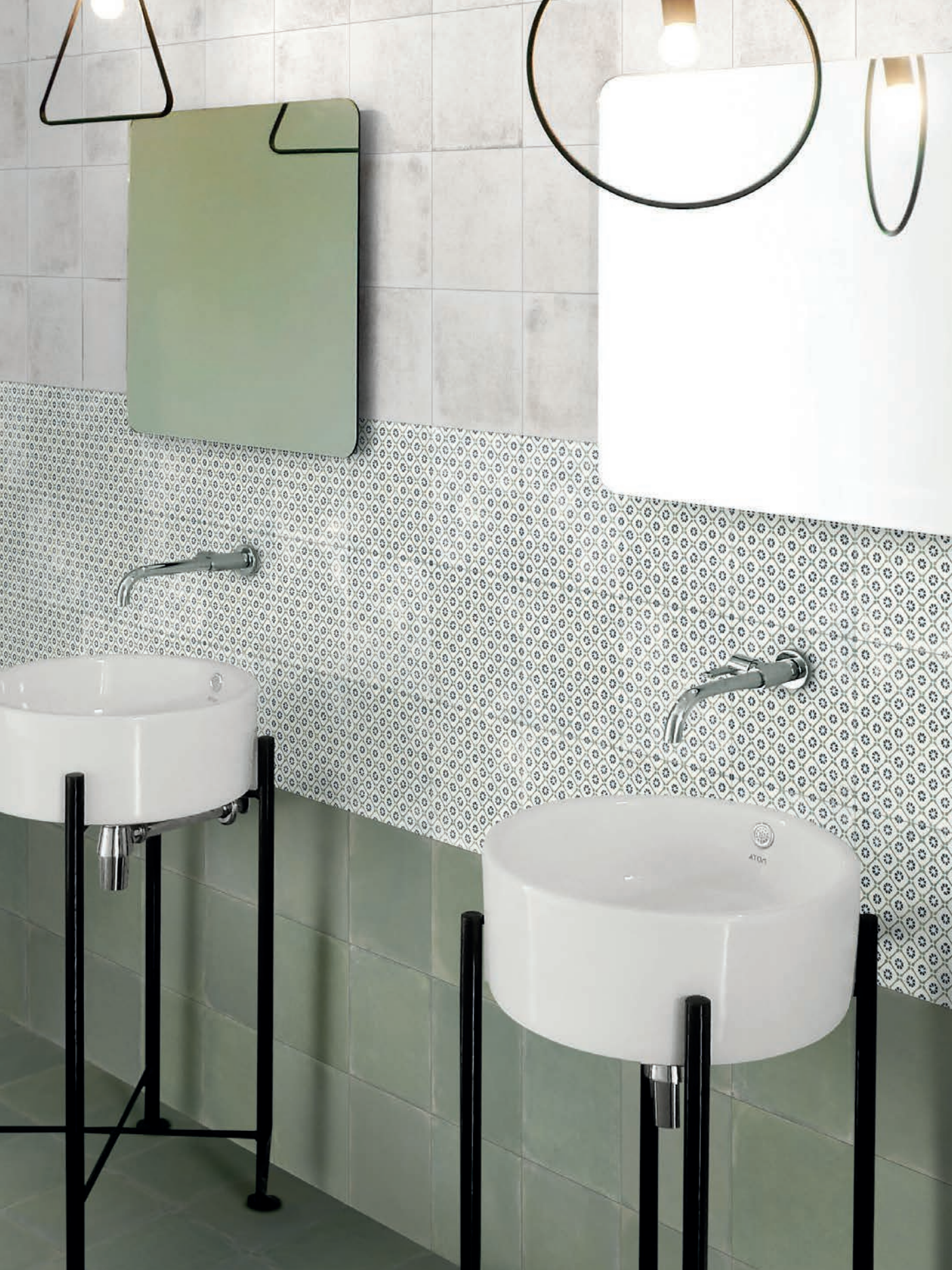
8"x8" Deco in Vin16 8"x8" Field Tile in Verde | Bianco