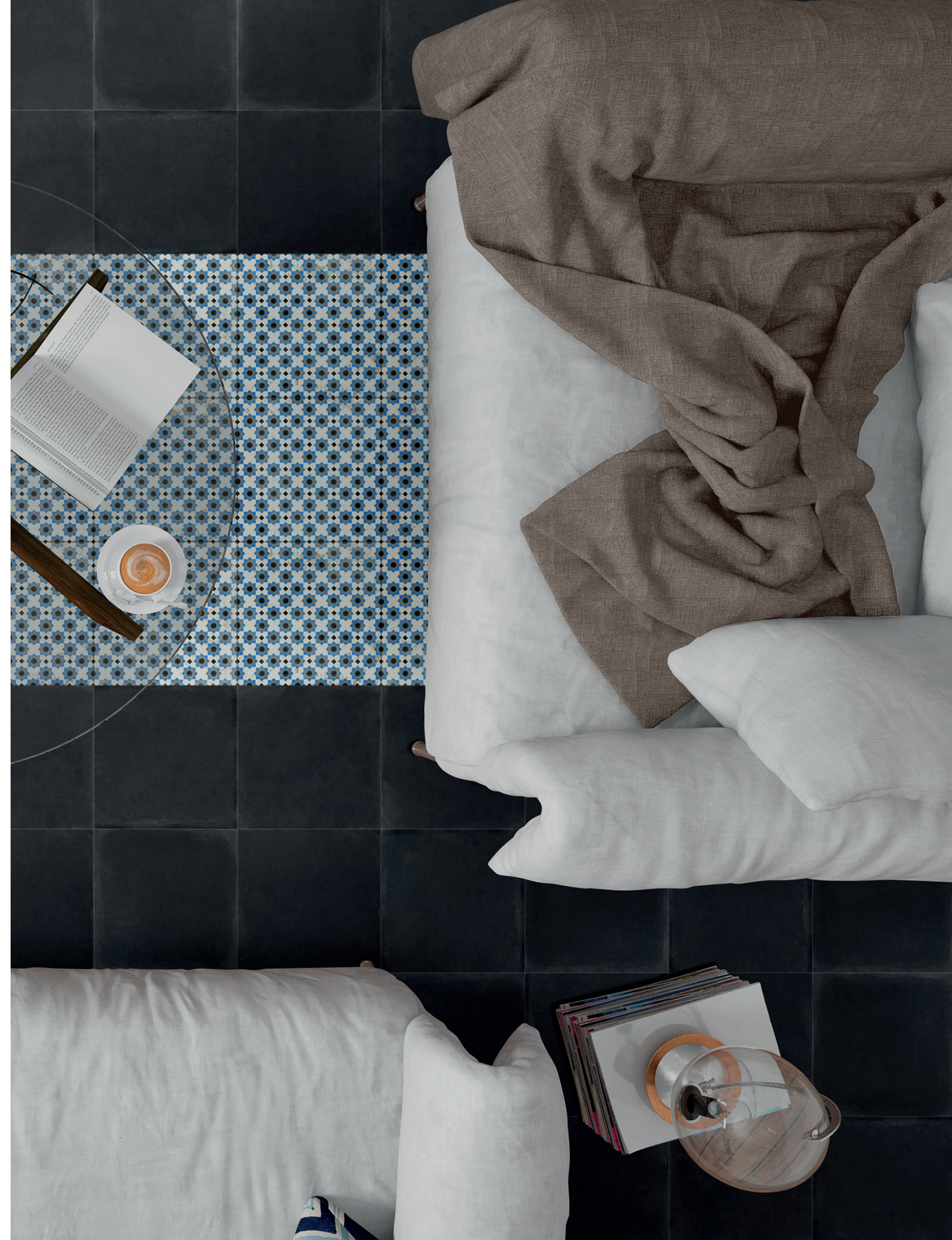
8"x8" Deco in Vin1 8"x8" Field Tile in Nero