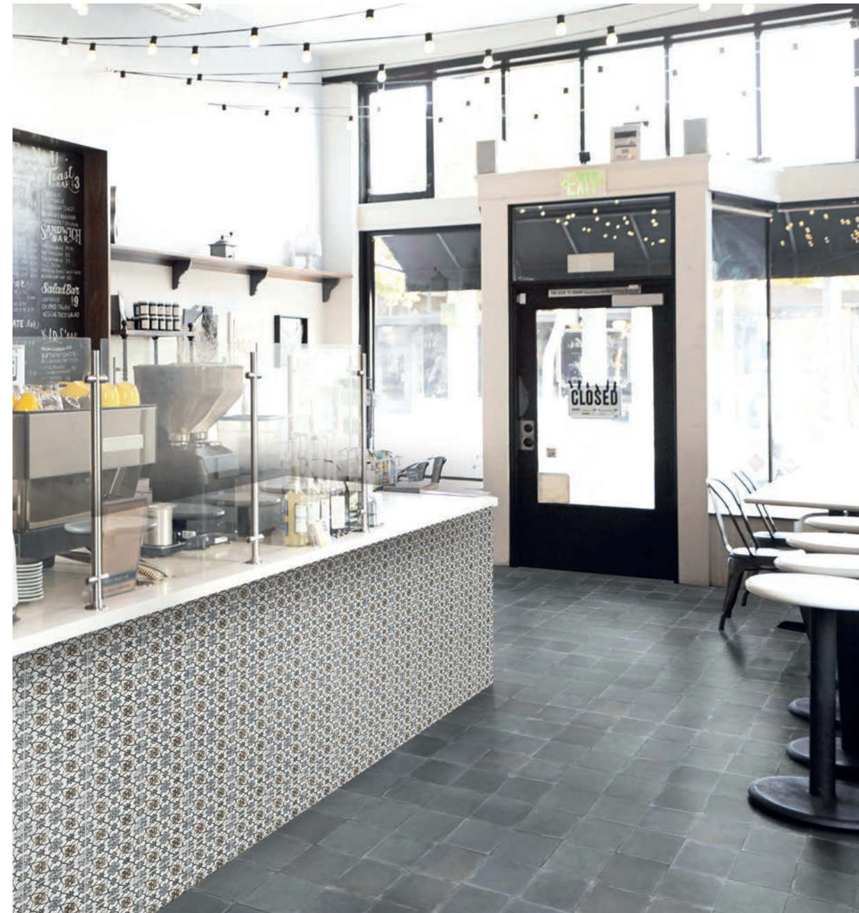
8"x8" Deco in Vin7 8"x8" Field Tile in Nero | Bianco