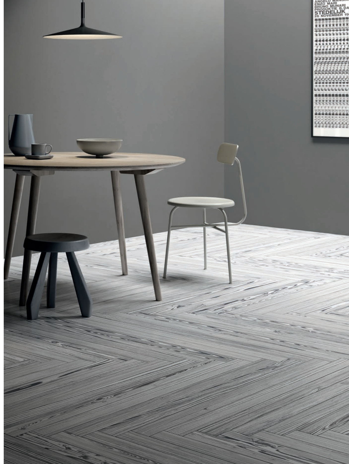
3"x48" Field Tile in Black