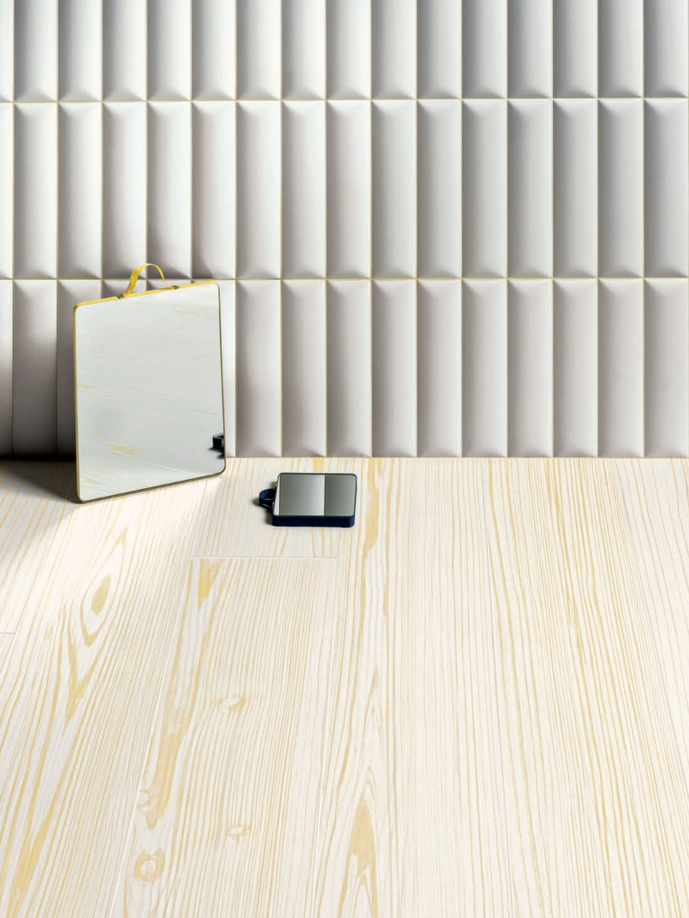
6"x48" Field Tile in Yellow