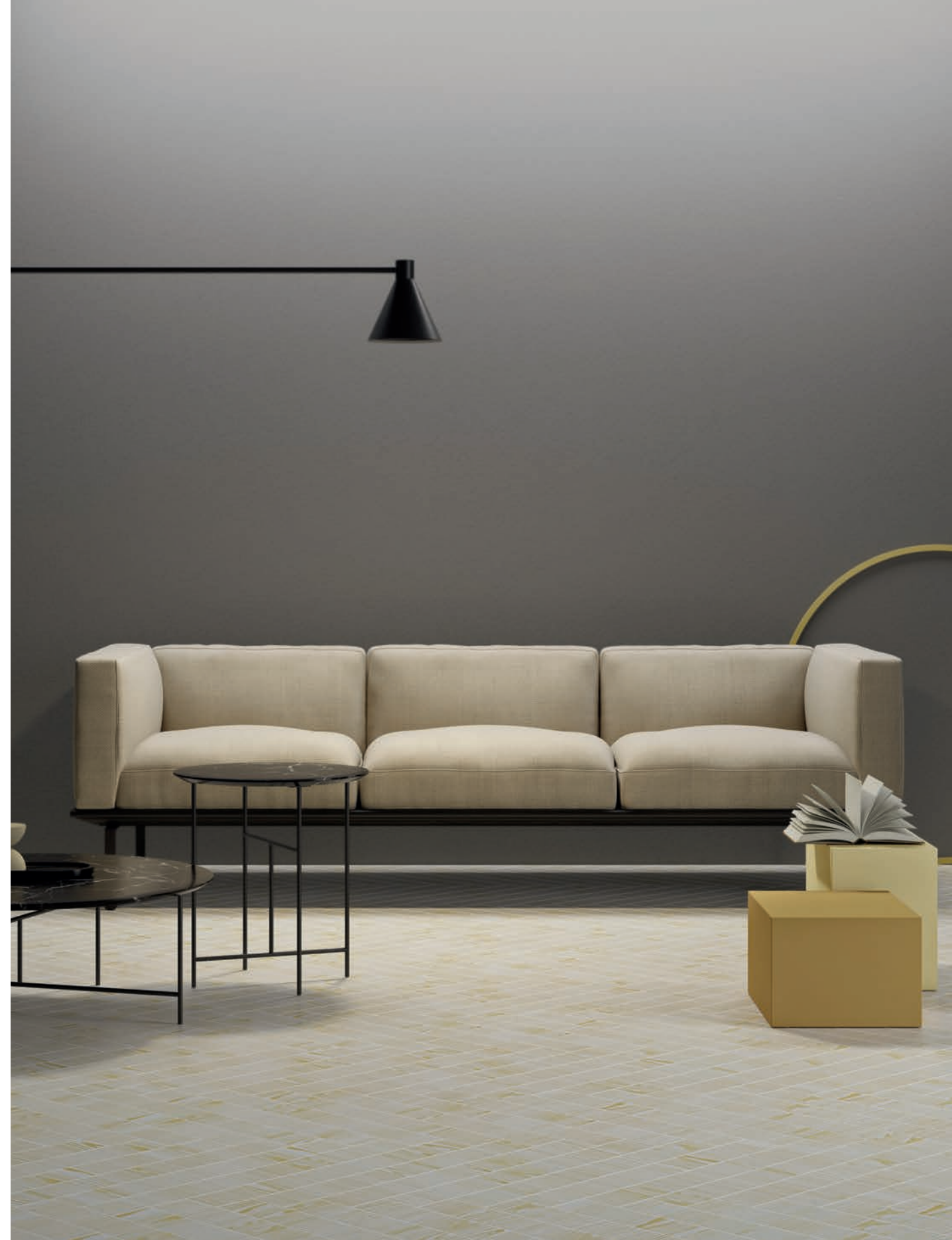
3"x24" Field Tile in Yellow