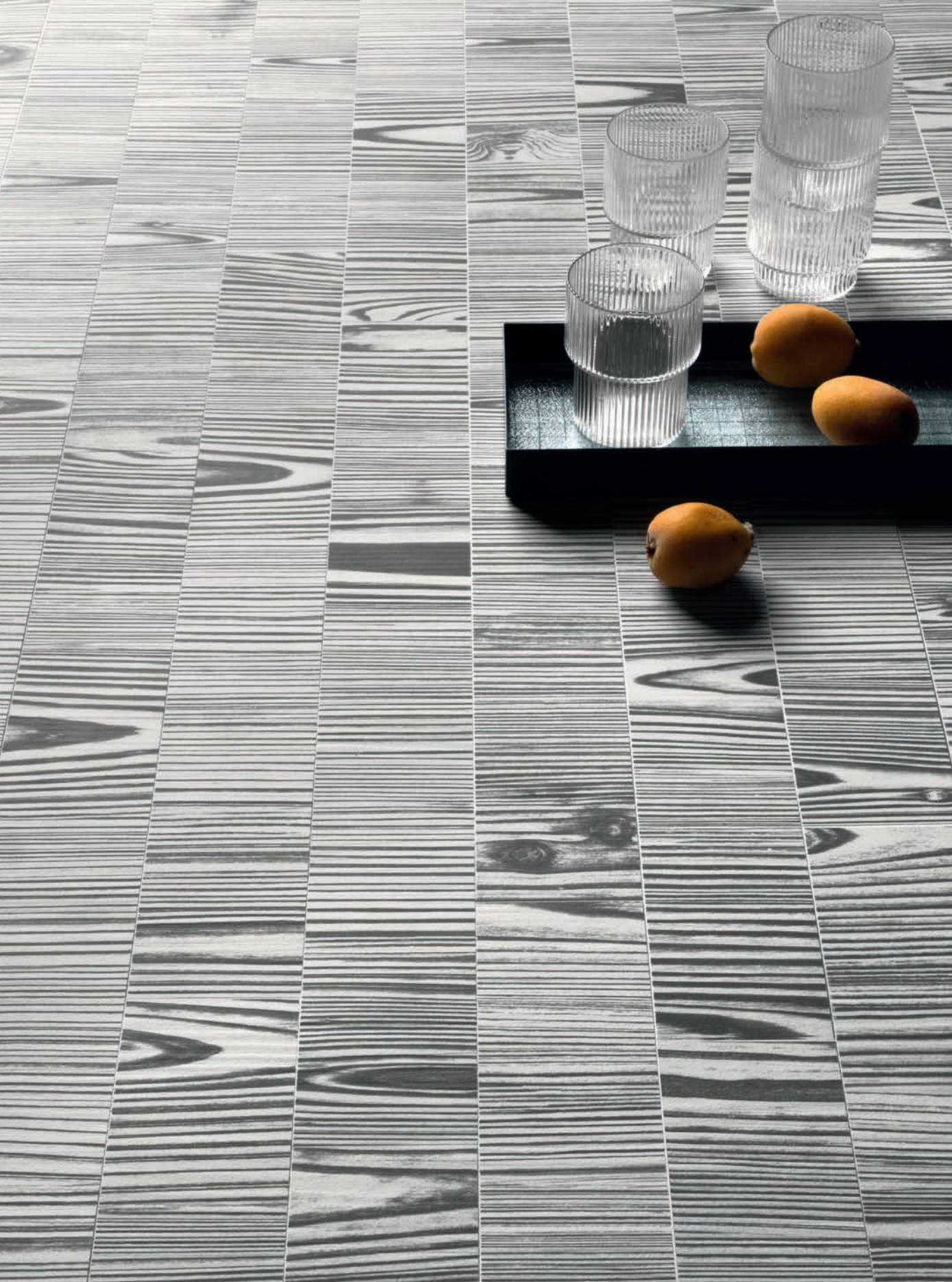
3"x24" Field Tile in Black