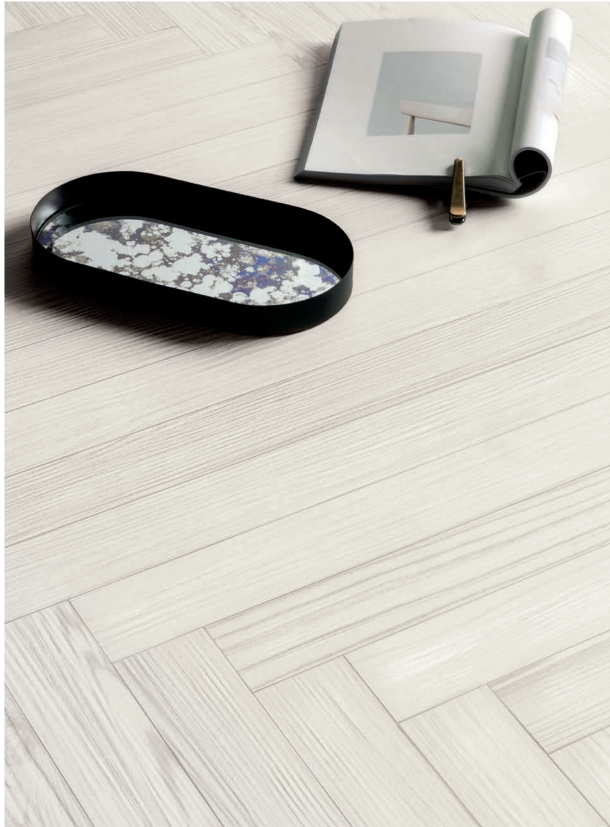
3"x48" Field Tile in White