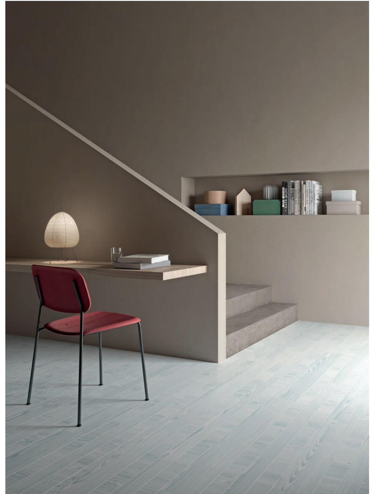
6"x48" Field Tile | 3"x48" Field Tile | 3"x24" Field Tile in Blue