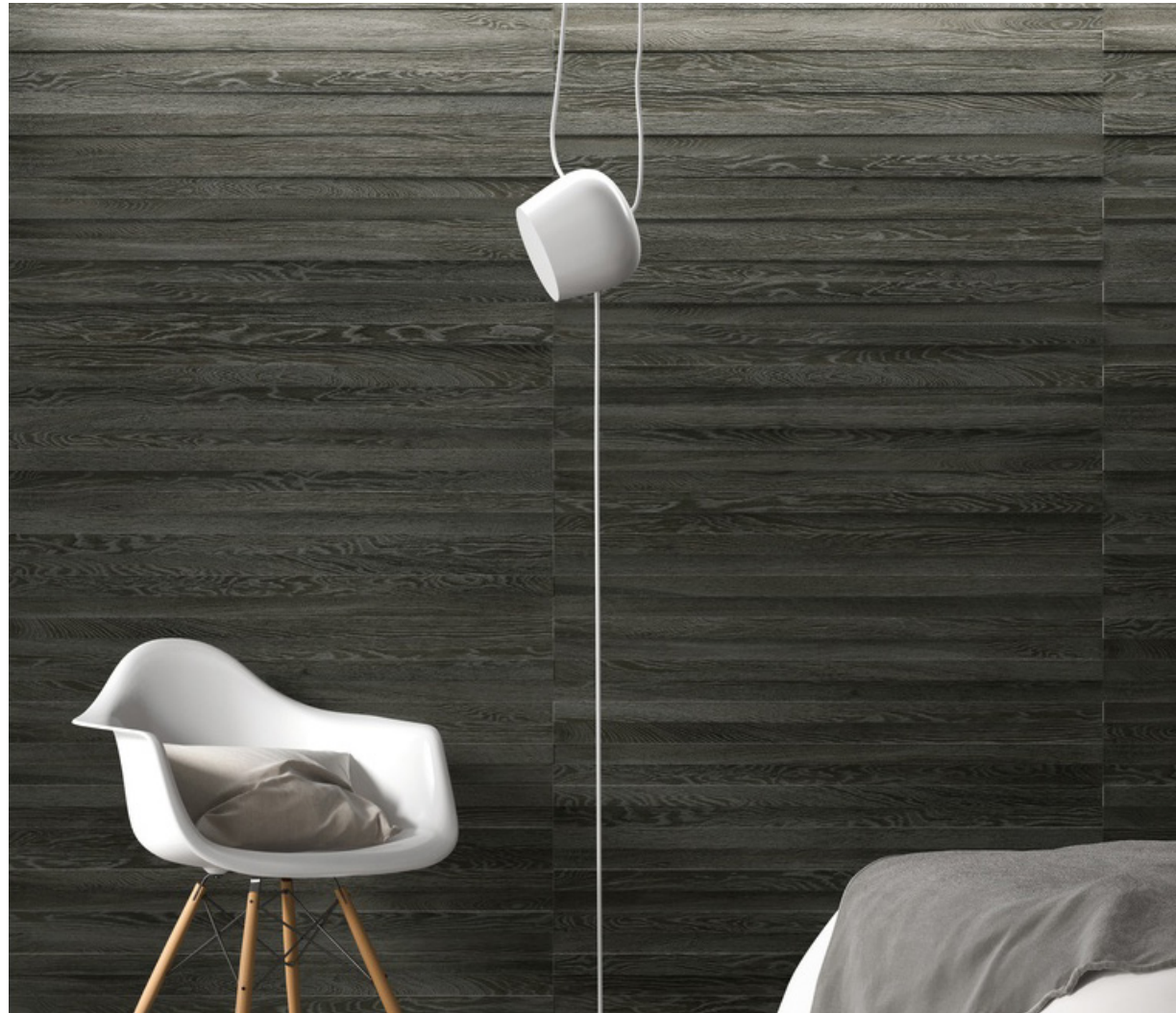
7"x48" Listel 3D in Charcoal