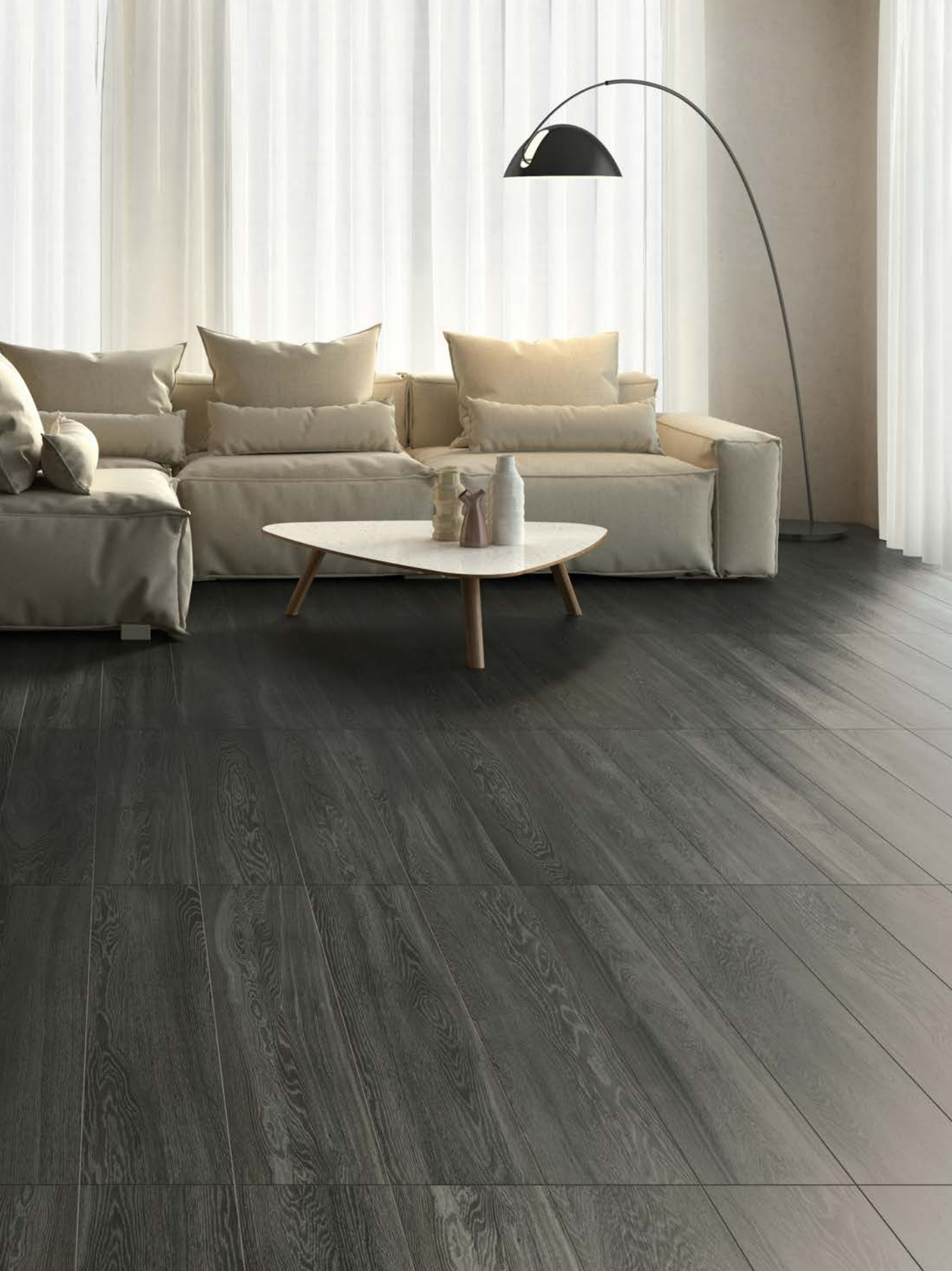
8"x48" Field Tile in Charcoal