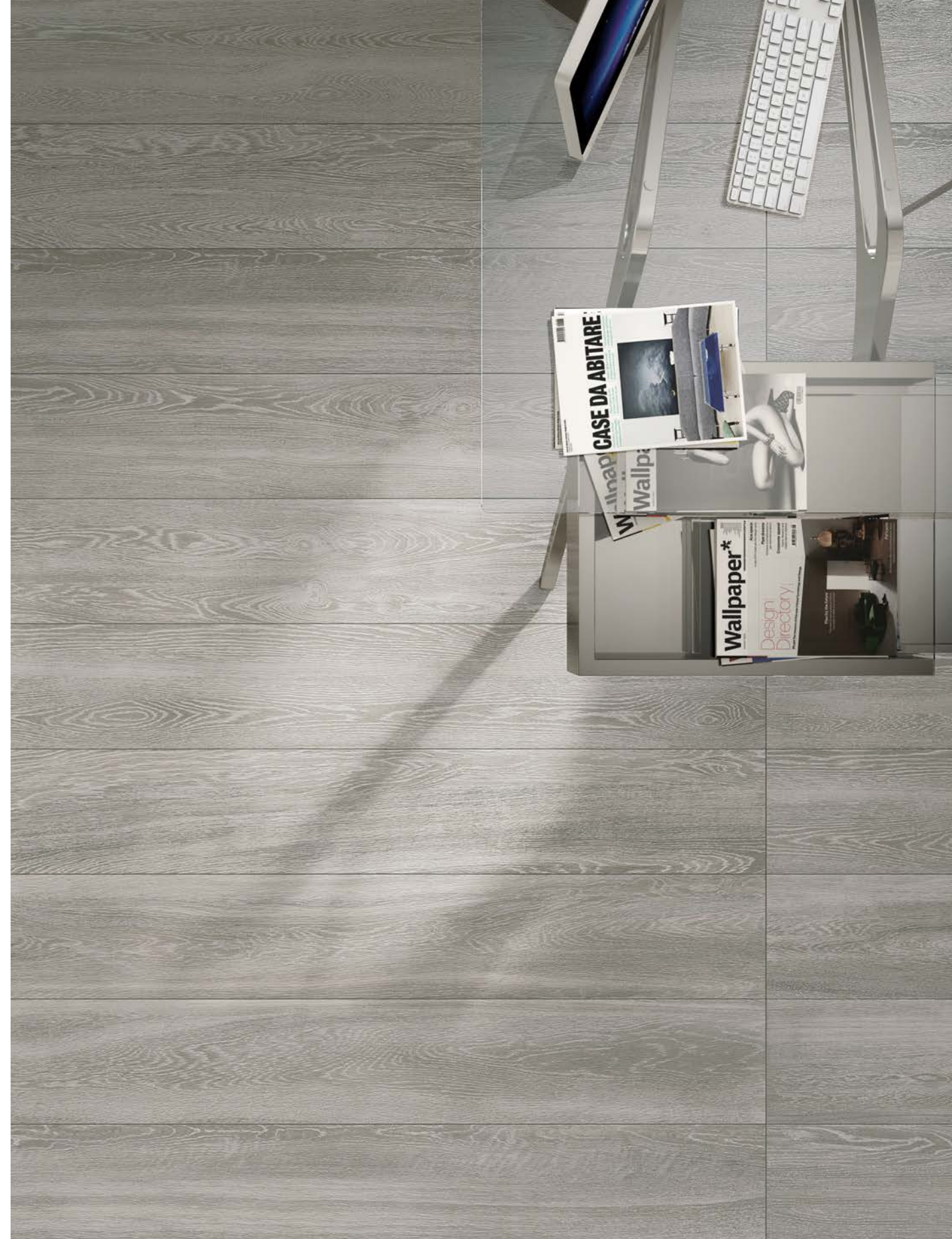
8"x48" Field Tile in Ash