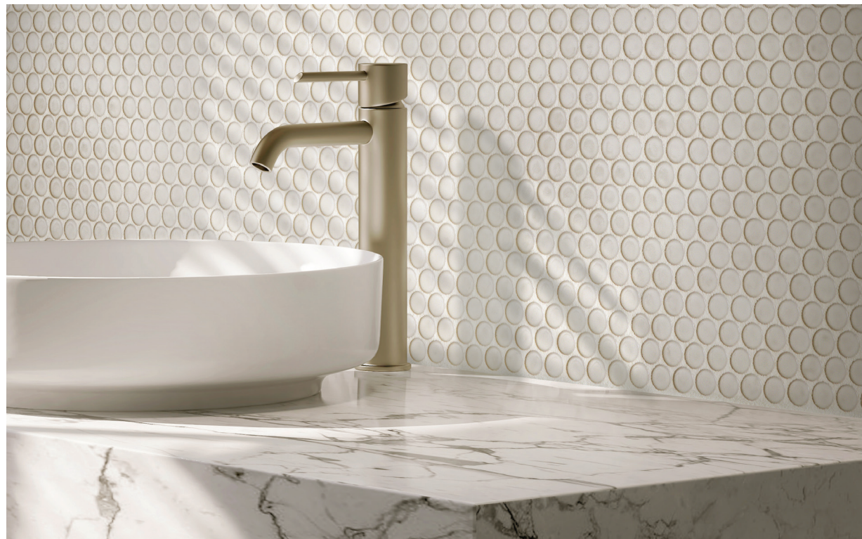
Burnt Edge Rounds Mosaic in White