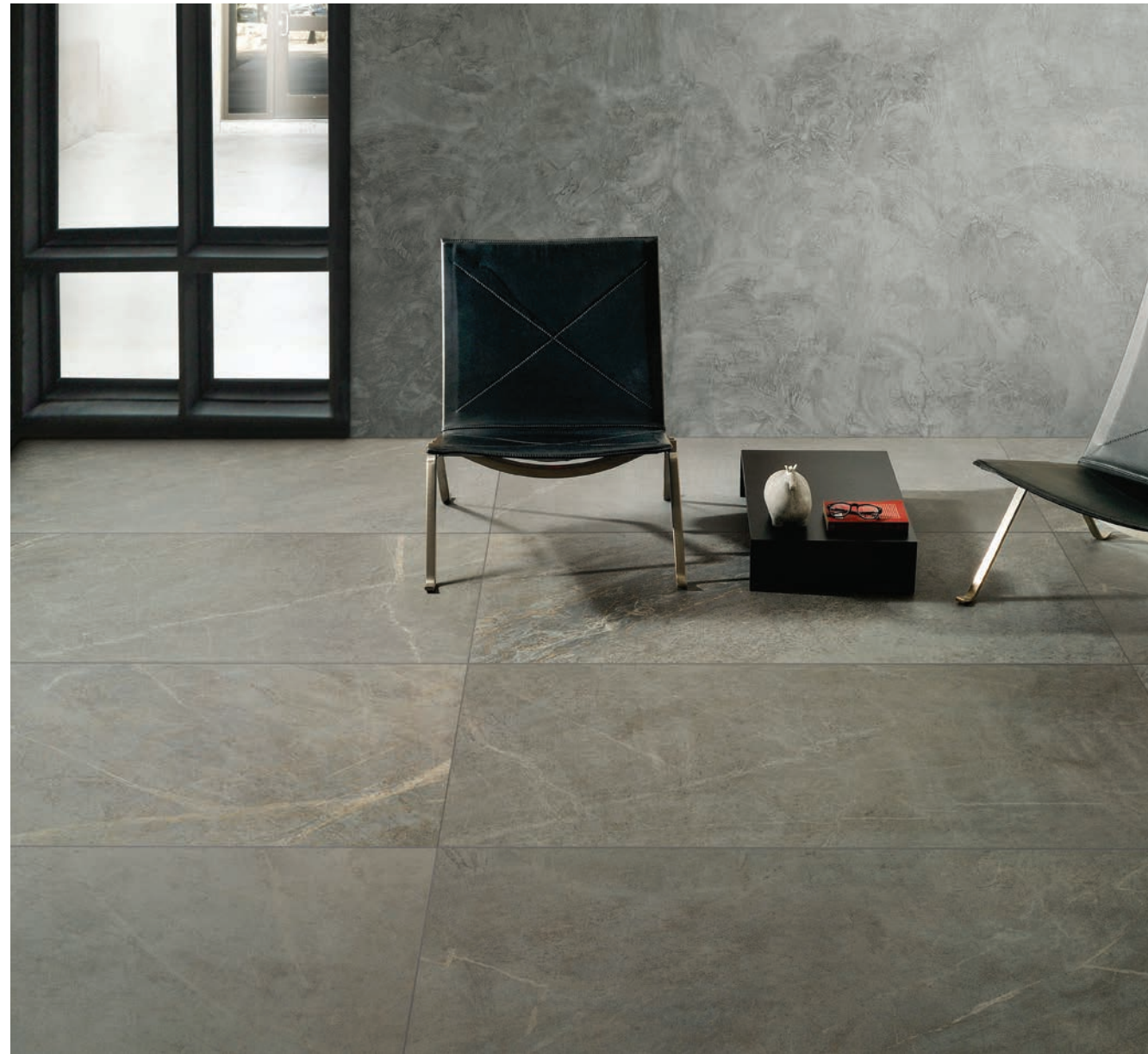
30" x 60" Field Tile in Green