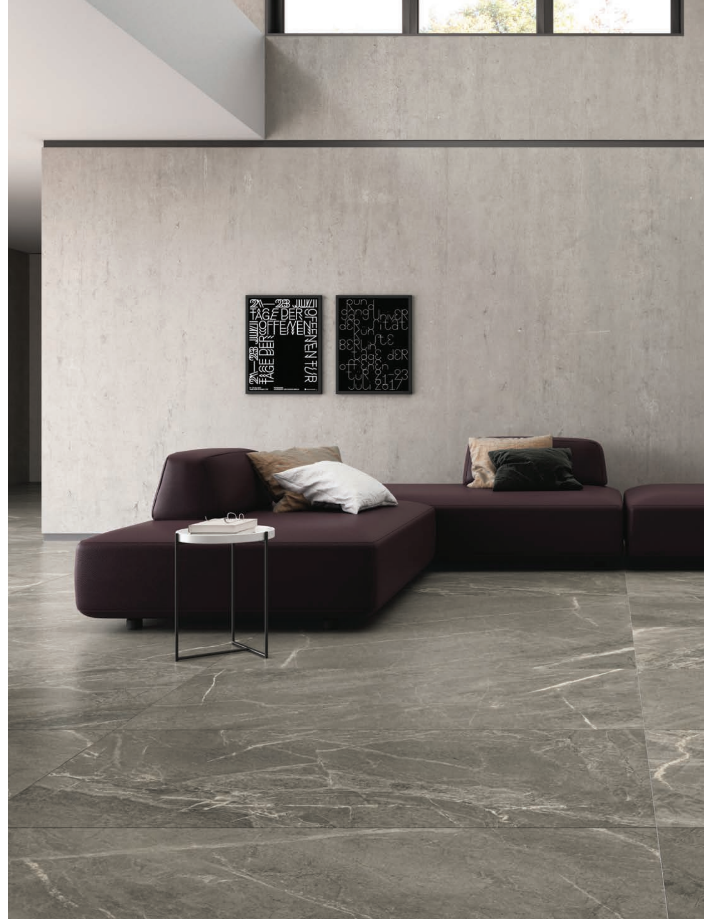
30" x 60" Field Tile in Grey