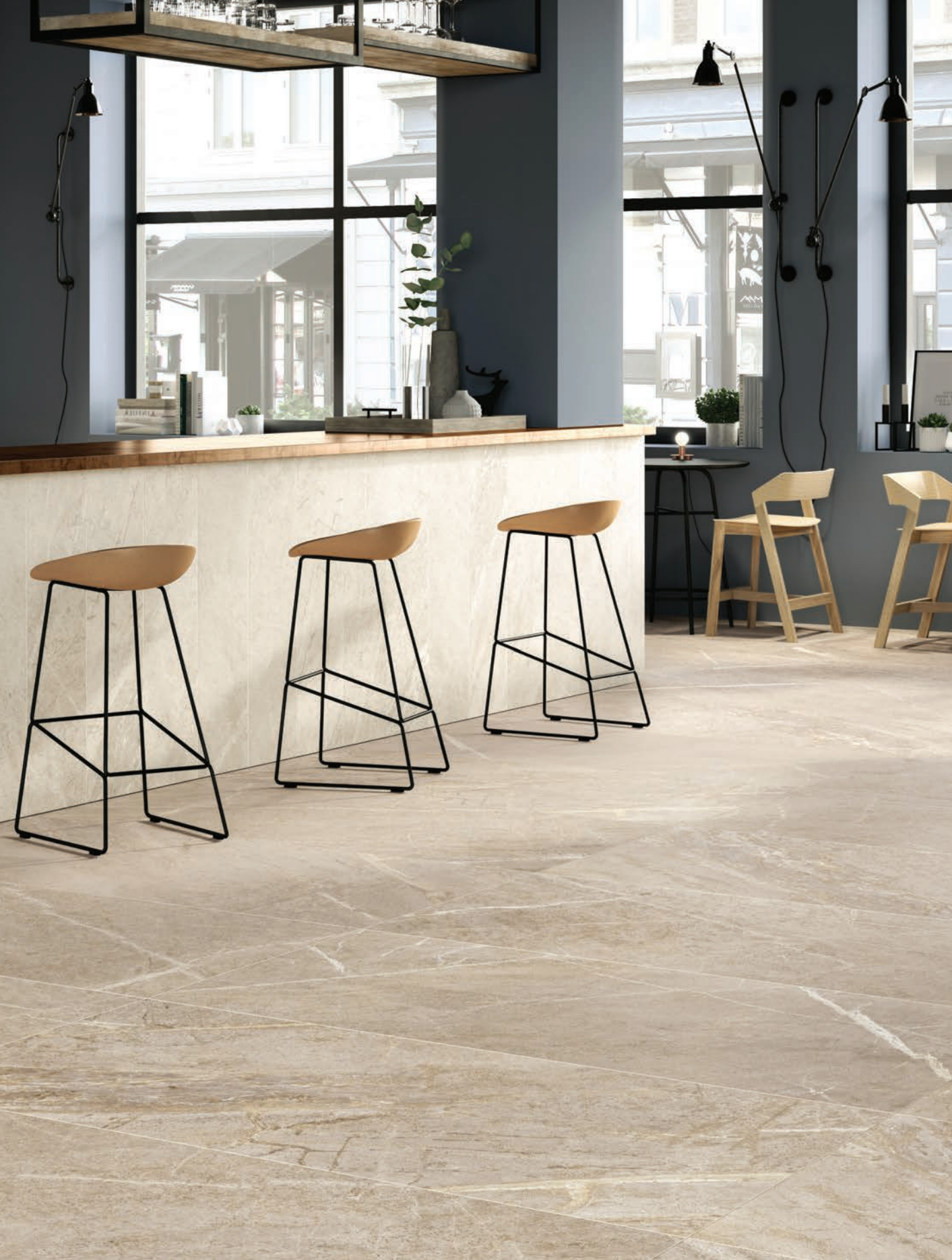
30" x 60" Field Tile in Greige