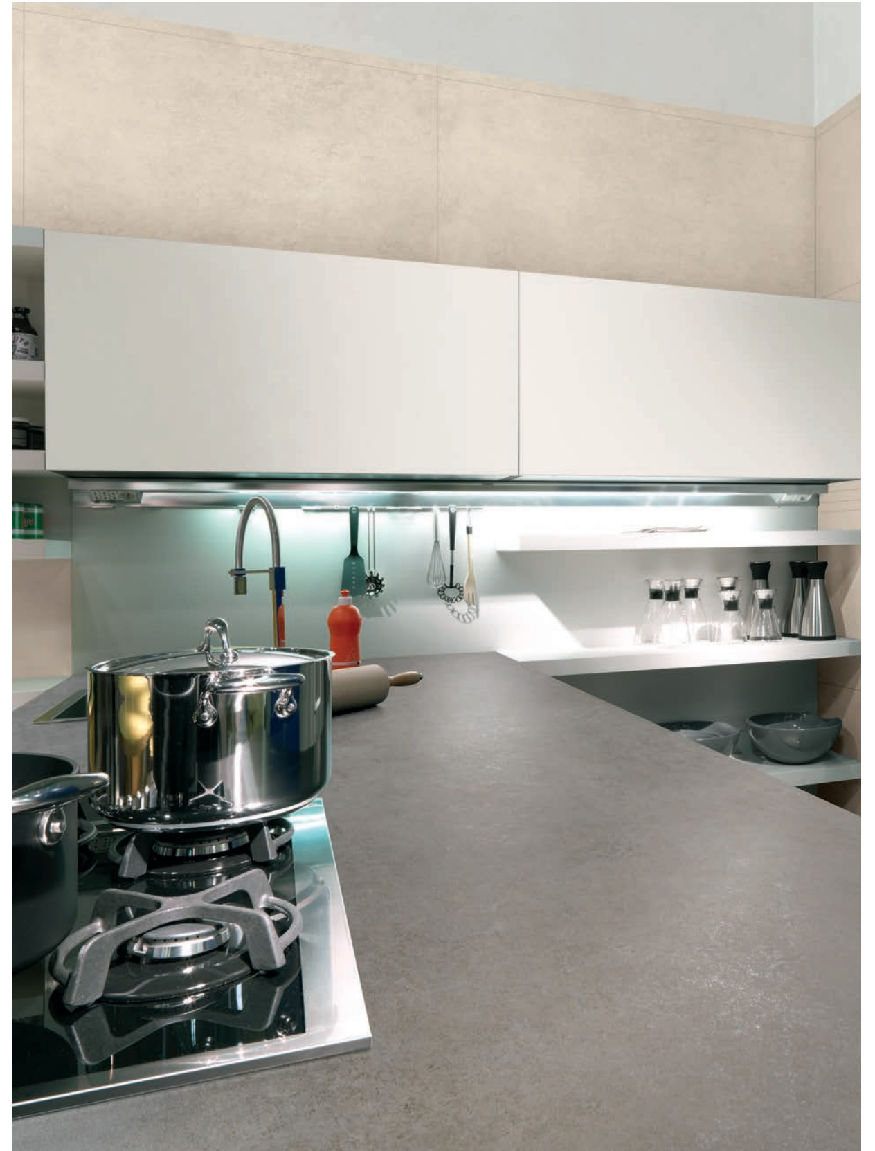
19.5"x39" 3.5mm THINNER Field Tile in Cotton 39"x118" 3.5mm THINNER Field Tile in Ask