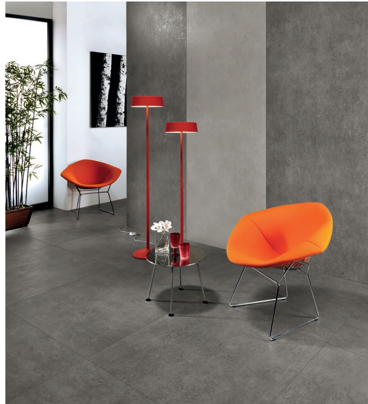
39"x39" 3.5mm THINNER Field Tile in Eclipse 39"x118" 3.5mm THINNER Field Tile in Nut | Eclipse