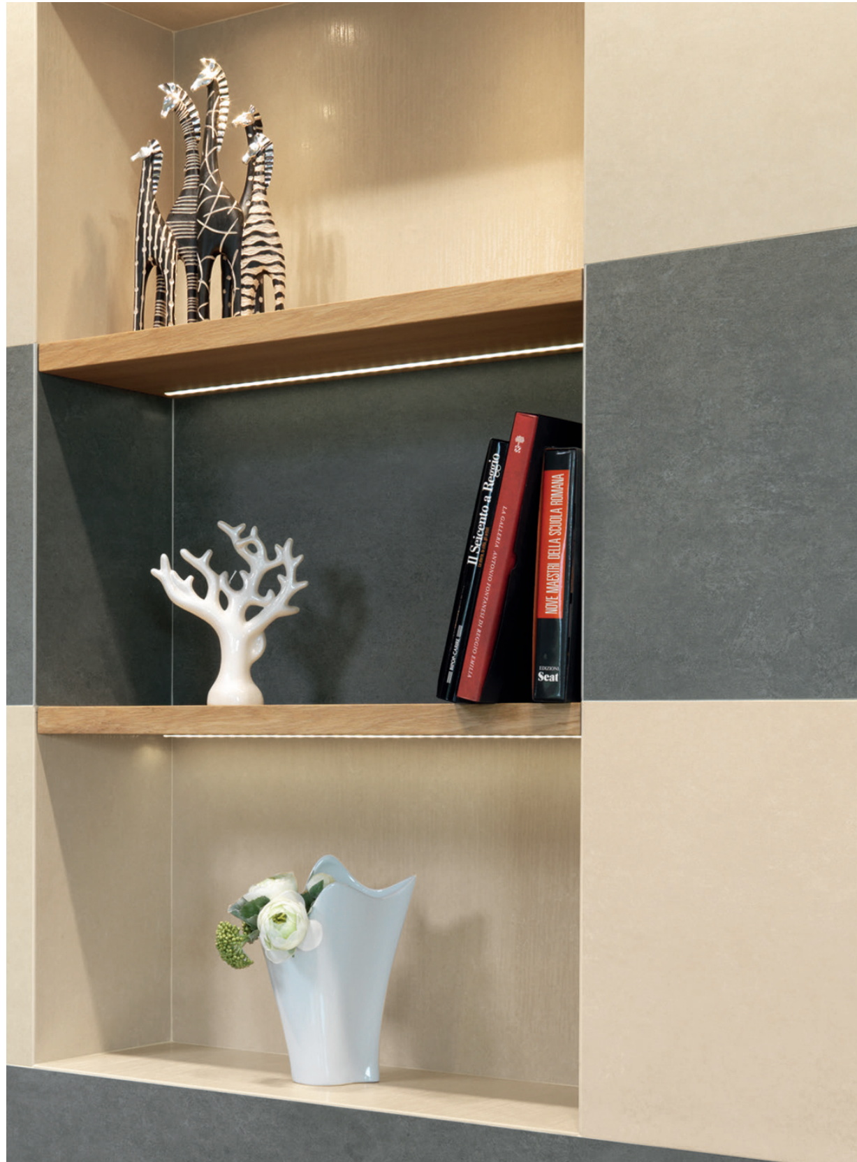
19.5"x39" 3.5mm THINNER Field Tile in Cotton | Eclipse