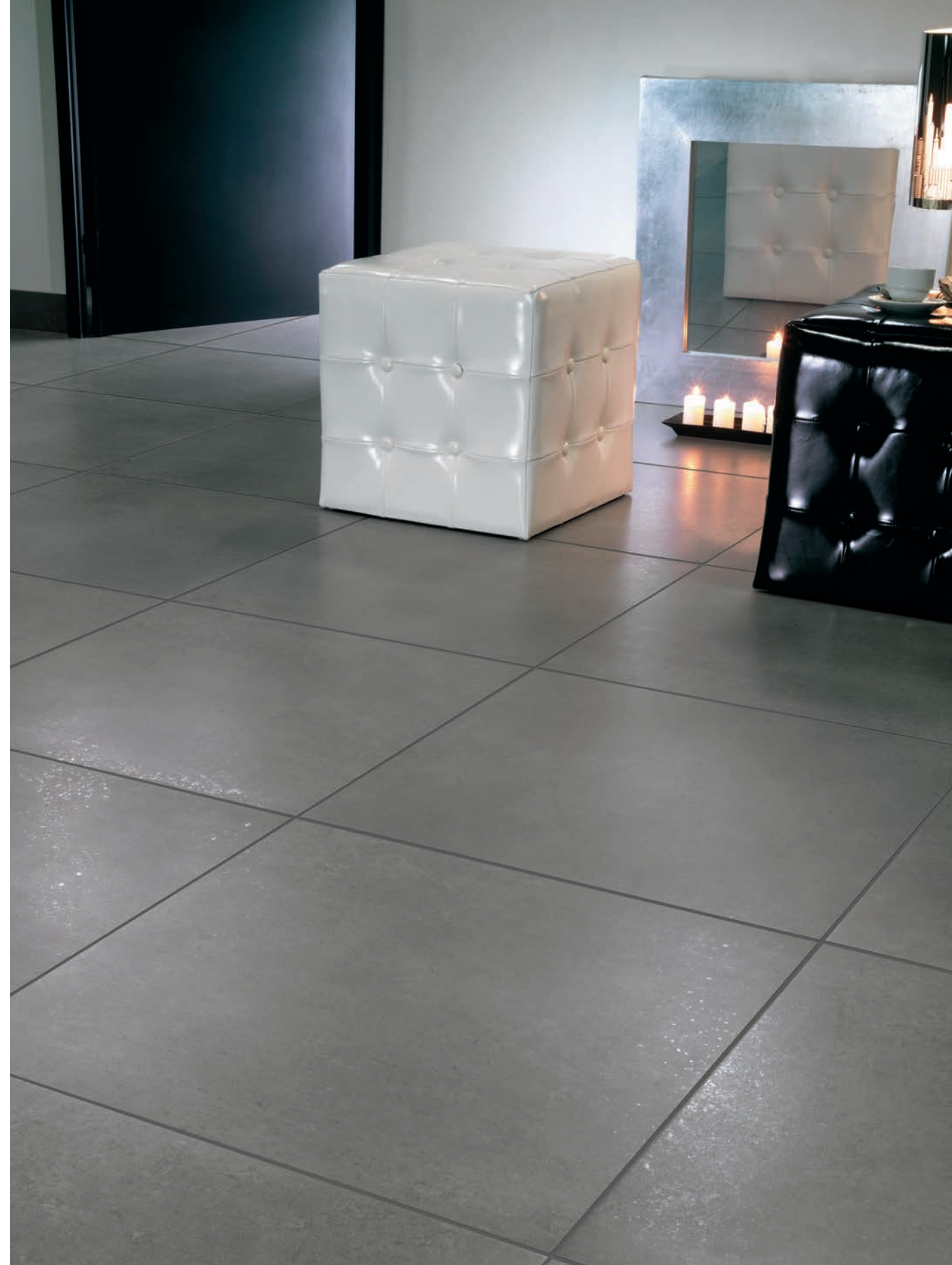
39"x39" 3.5mm THINNER Field Tile in Ask