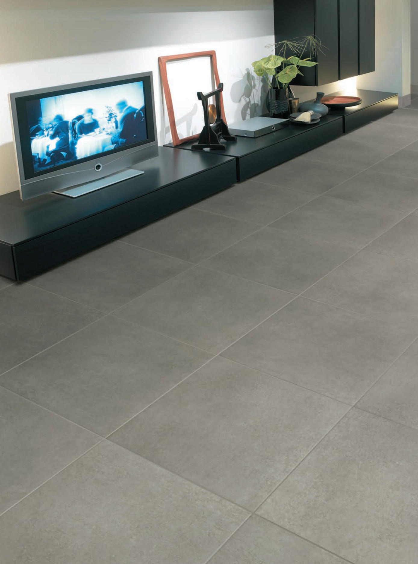
24"x24" 10mm Field Tile in Titanium