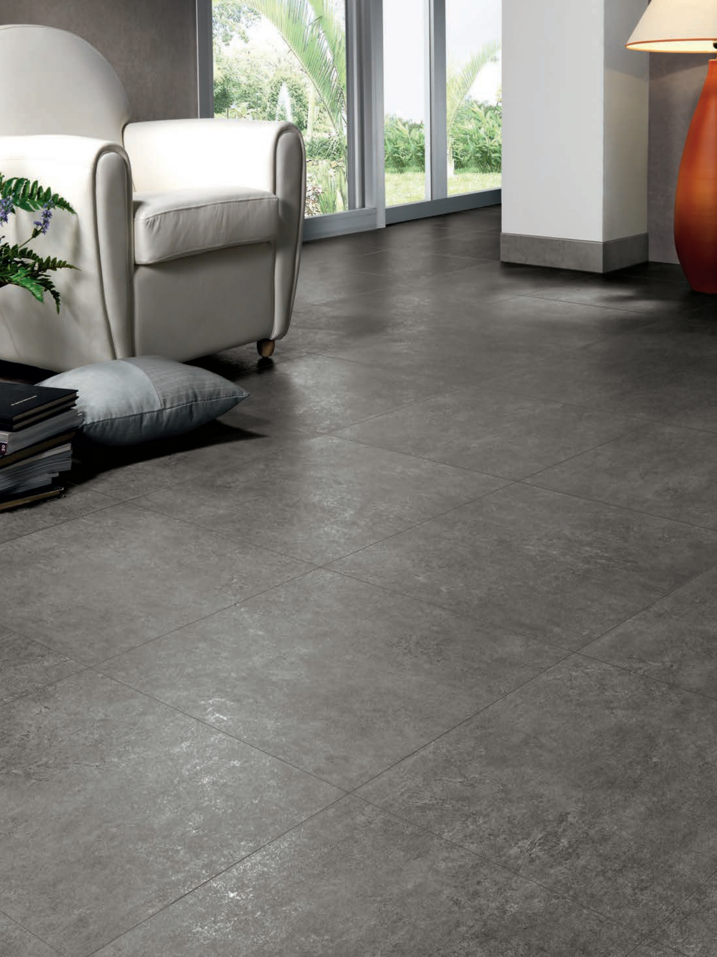
24"x24" 10mm Field Tile in Eclipse