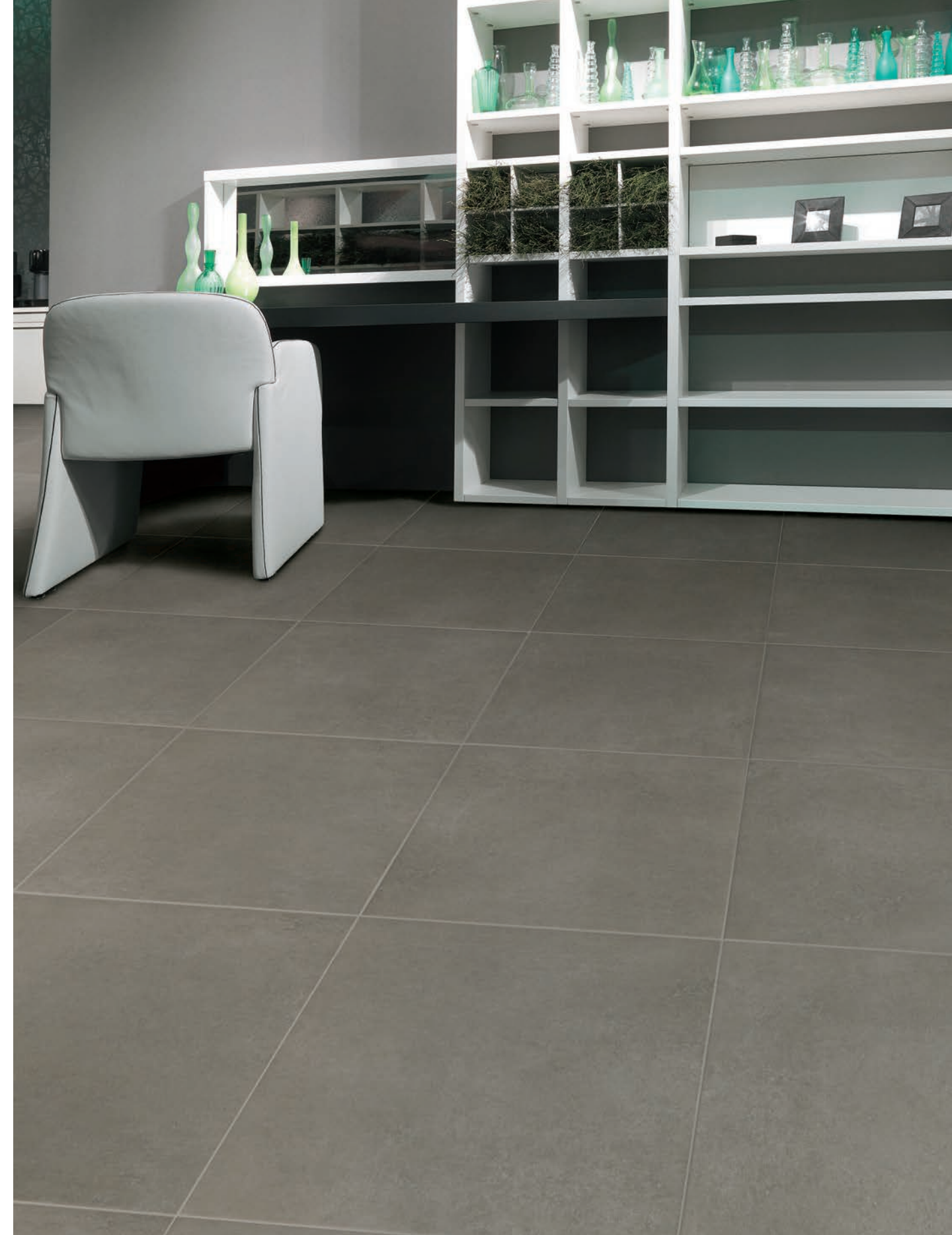
39"x39" 3.5mm THINNER Field Tile in Velvet