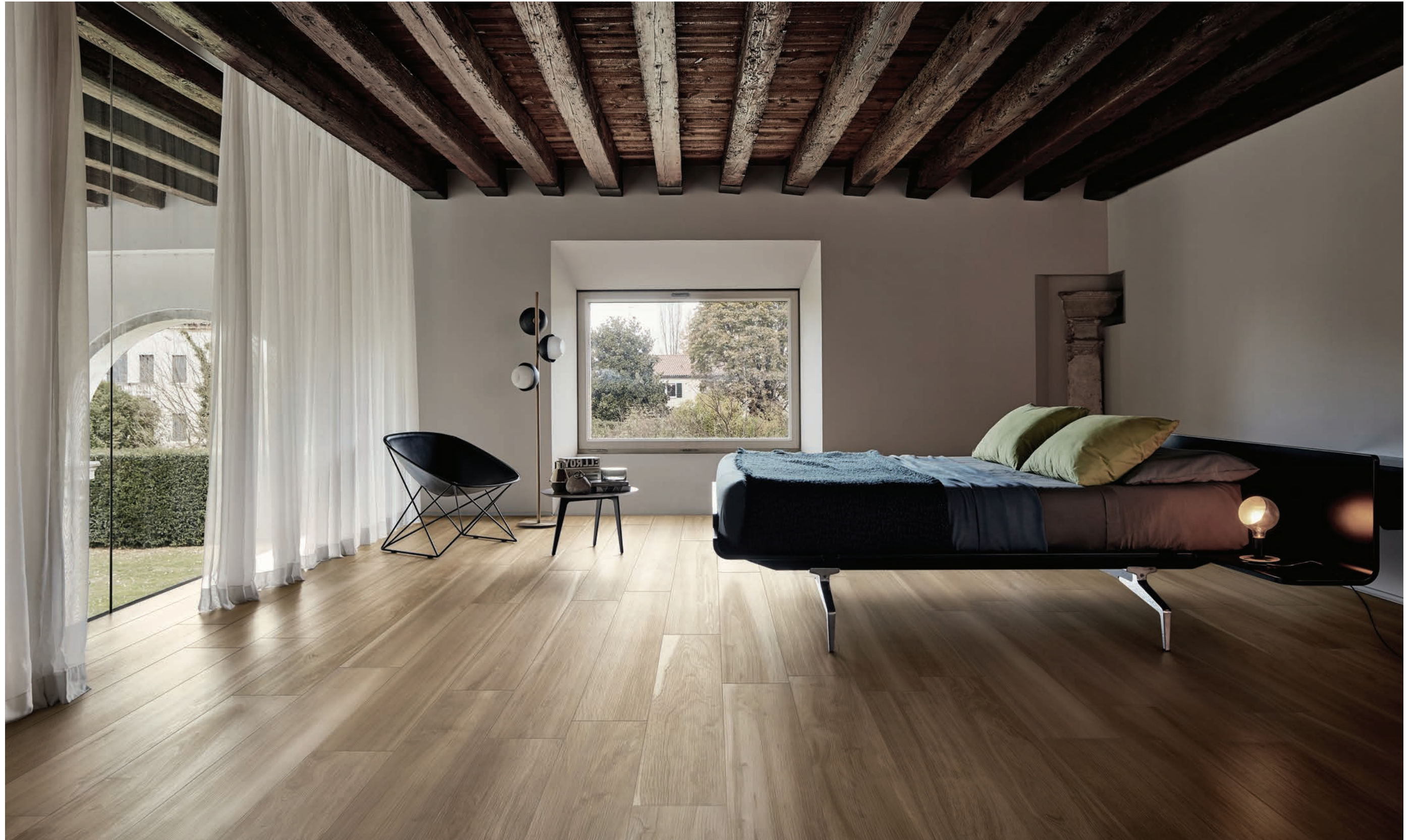
8" x 47" Field Tile in Beige