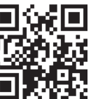
8"x47" Field Tile in Beige